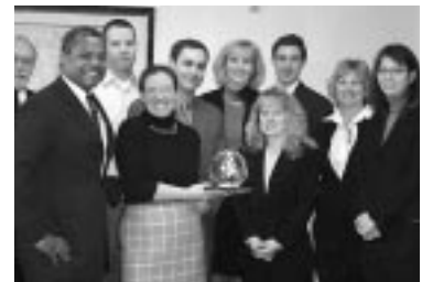
Robinson & Cole, 2003 Outstanding Law Firm Volunteers